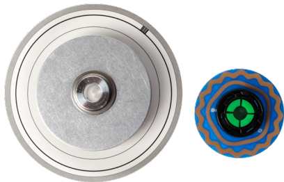
Figure 2: An optical glass disk and AMT rotor compared side by side.

The AMT encoder's ASIC-based construction is far less susceptible to vibration than the fragile glass disk of an optical encoder.